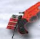
Visual Distress Signal